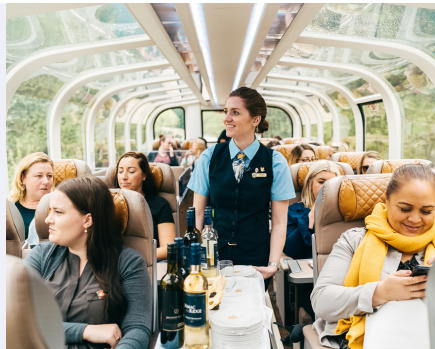
Complimentary Wine & Cheese