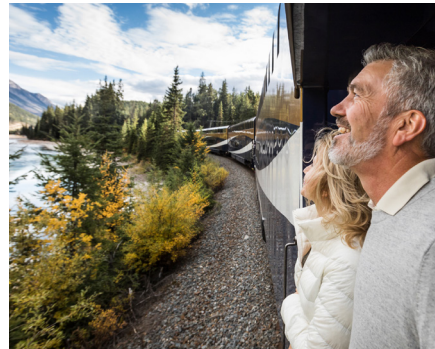
Exclusive Outdoor Viewing Platform